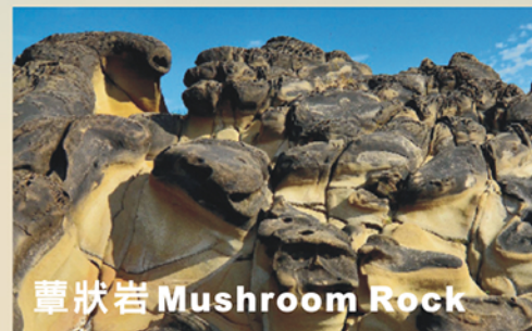
蕈狀岩 Mushroom Rock

Visitors to Xiaoyeliu will discover intriguing cuestas-landforms that slope gently on one side and descend steeply on the other. They are formed from layers of alternating sandstone and shale.