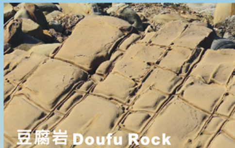
豆腐岩 Doufu Rock

Many of the rocks at Xiaoyeliu have a honeycombed surface resulting from the digging of organisms. Piercing, marine erosion, and weathering which creating innumerable pits are produced on the exposed rock.