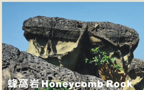
蜂窩岩 Honeycomb Rock

The coral reefs at Xiaoyeliu are partly exposed at low tide. They were thrust up from the ocean floor by tectonic movement, over the course of millions of years.