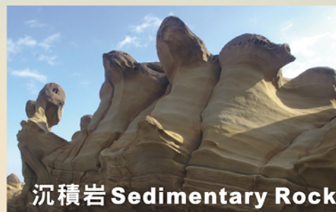
沉積岩 Sedimentary Rock

Doufu Rock is a peculiar landform made of sandstone crisscrossed by two sets of nearly perpendicular joints that form zones of weakness vulnerable to erosion.